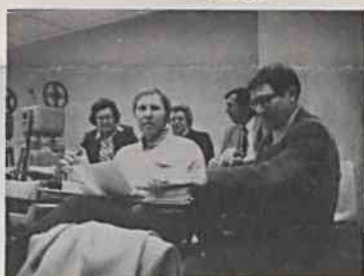
Members at work on Long Range Planning Committee