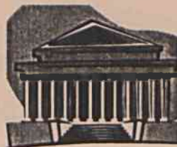
Financial Aid Advising