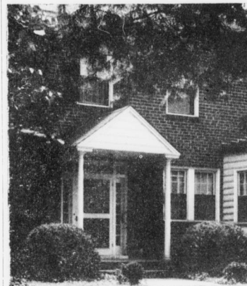
North entrance of the Alumni House

Comfortable accommodations for parents or that special friend A gracious setting for wedding receptions or showers