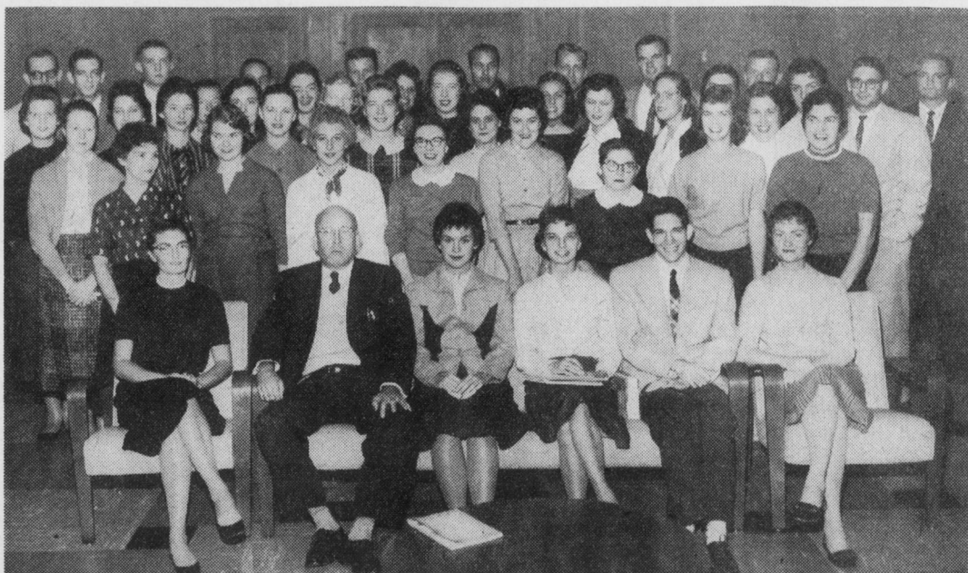
FIRST FTA MEETING OF THE YEAR

So take out your pen and paper, think a little, write a little, and turn in a fighting song to be used as a spirit rouser for all the Guilford games to come.