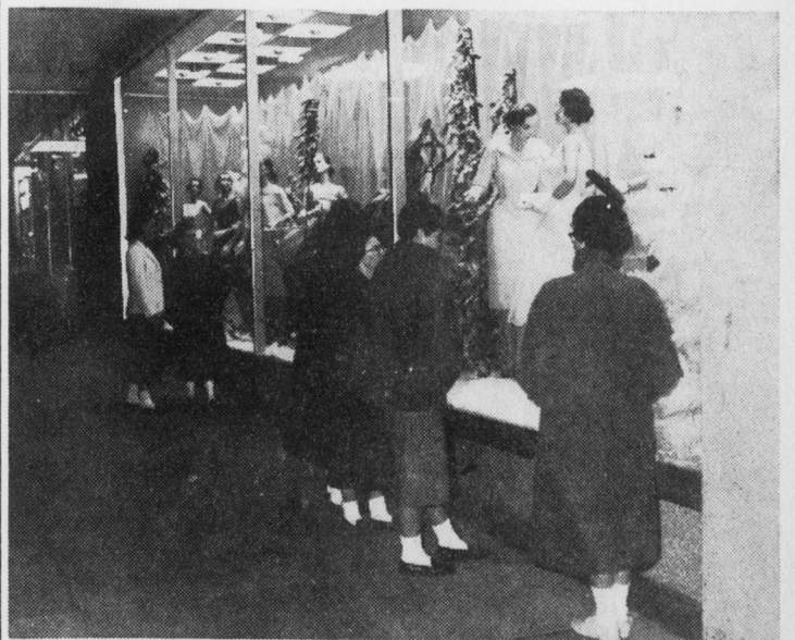
The Christmas bug is catching up with us. Window shopping is a prerequisite for Christmas buying for these Guilford girls.

Remember that three days before and after vacations are non-cut days. Therefore no cuts will be allowed before and after Christmas vacation on December 18, 19, 20 and January 5, 6, 7. Take care not to cut on these days.