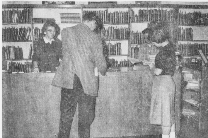
Library rush days will soon slacken pace.

Now that the plague of examinations has hit the student body, more and more studious scholars are spending more and more time in the library—a place which most of them haven't frequented for the past semester. The final draft of a term paper, a hurried semester project, a last book report—these are reasons for the huge flock which has begun a library vigil.