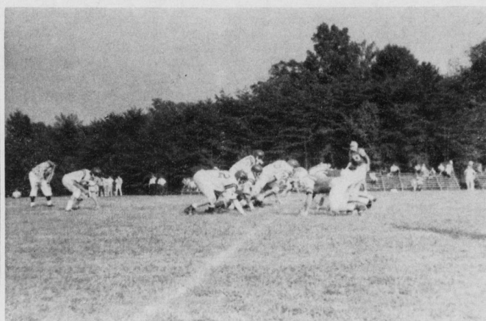
Guilford -vs- Hampden-Sydney.