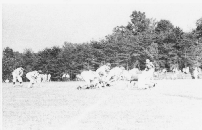
Guilford vs. Hampden-Sydney.