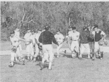
This happy scene is the result of a 4-3 baseball victory over arch-rival High Point last week. If there was any doubt as to the school, just check the new electric scoreboard which clearly shows the victor.