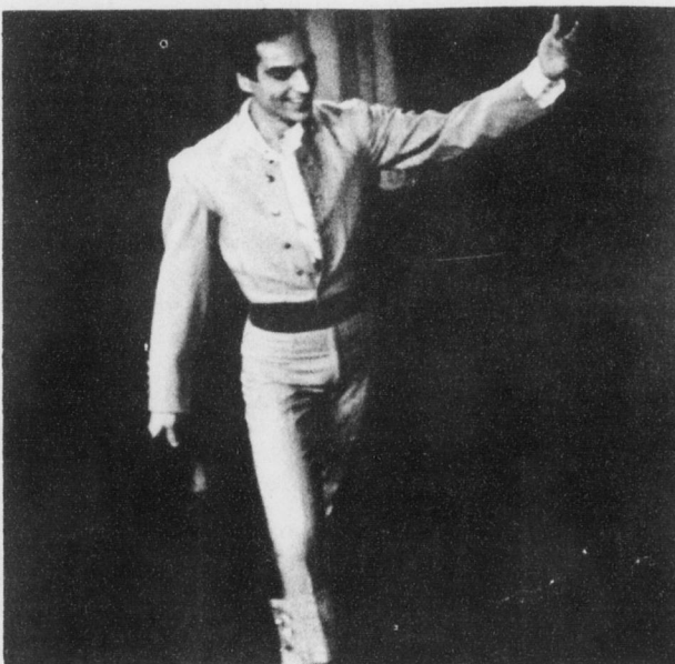
JOSE GRECO TO APPEAR OCTOBER 10

He has performed in movies, including Michael Todd's production of "Around the World in 80 Days". He can also be seen in "Ship of Fools."