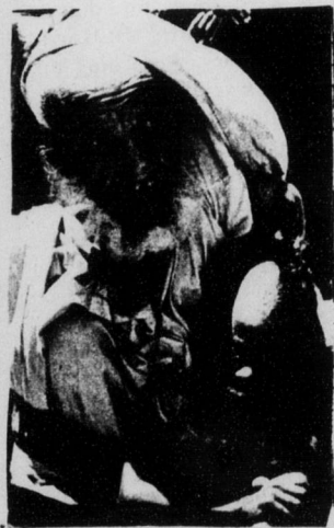
Grandfather and grandchild wait for a CARE food distribution in drought-seared Africa.

But the amount of aid rendered and the number of lives saved depends upon contributions from compassionate Americans. Those who wish to help can mail tax-deductible donations to CARE African Drought Famine Fund, 2581 Piedmont Road, N.E., Room 23-A, Atlanta, Georgia 30324.