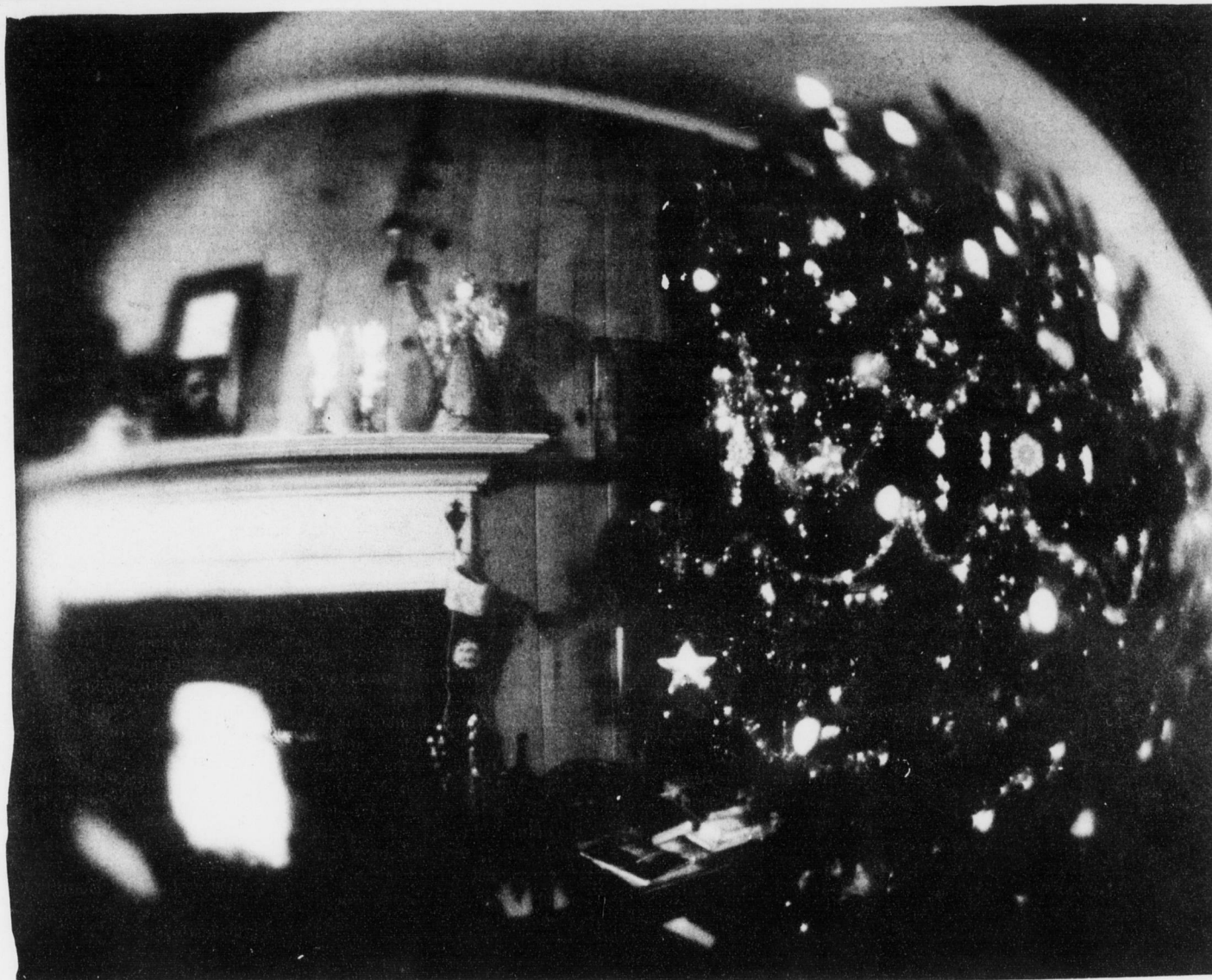
Christmas fades into memory as second semester begins