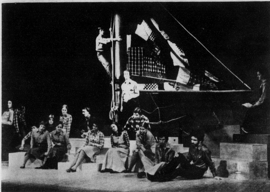
The Cast from "Praise" in the "green scene"