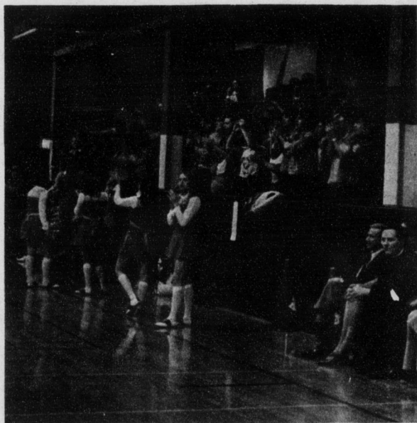
Despite lack of support, cheerleaders "kick on" whopping-up spirit from the Quaker crowd of fans.