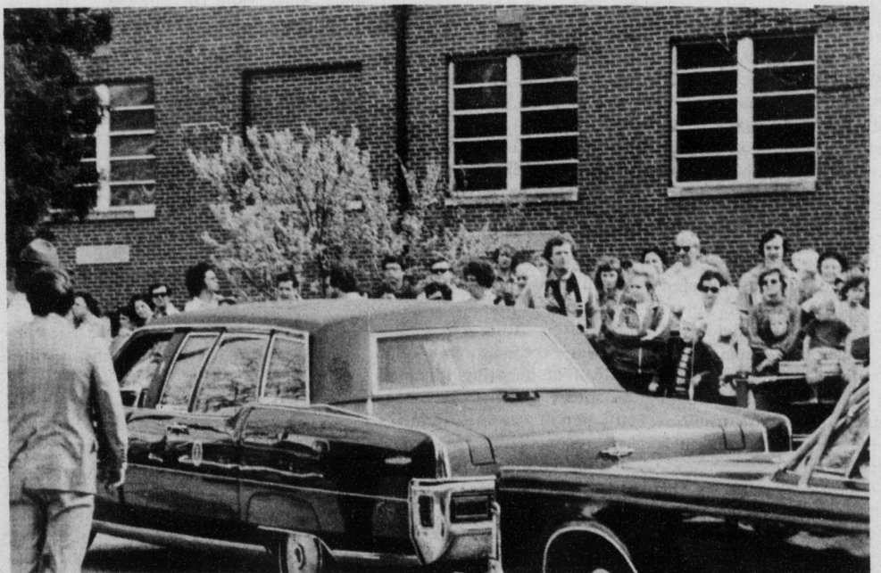
Presidential motorcade delivers Mr. Ford to Founders