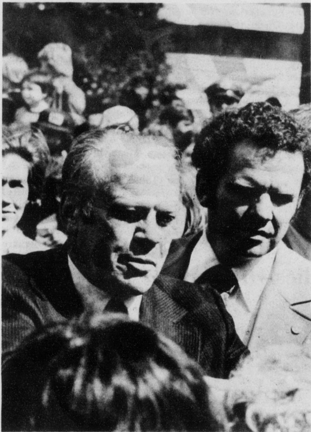
Ford Pressing the Flesh