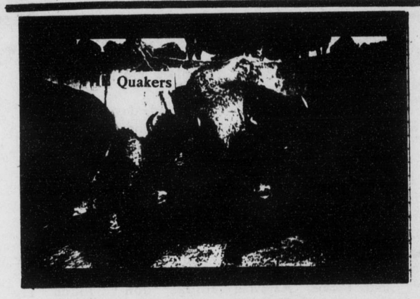
The football anxiously awaits their new leader