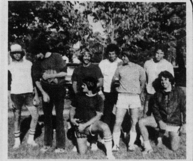
Milner Second North

were Shore and Milner 2nd North. They were both soft-