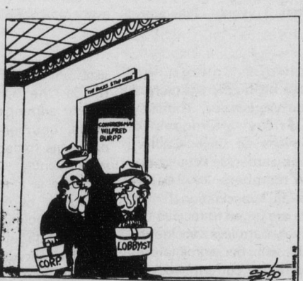
"Now that's inflation . . . 2 years ago I bought that same guy for half price."