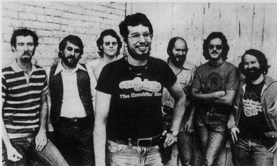
Who are these guys?