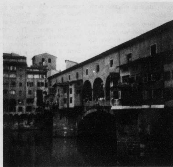
Ponte Vecchio in Florence.

a fall vegetable garden behind the Frazier Apts. Help support good clean food. Possibly a simple greenhouse could be rigged up.