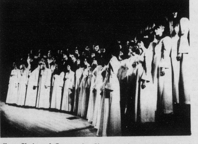
College Choir and Community Chorus performed "A Christmas Offering.'

Anyone interested in the 1979 Munich Semester should go by the Center for Off Campus Education in Frazier Apt. #21 for more information.