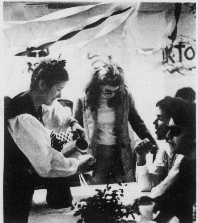
Because food and beer were served directly to the guests, problems usually associated with keg parties didn't arise. Many felt it "was the best party Guilford has ever had!"