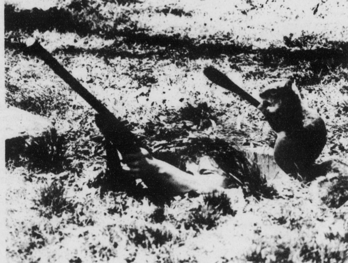
The clever critters see through another squirrel blind, and hostage 53 joins the club.