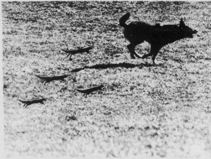
Squirrel attacks are not limited to humans. Here, a battle-frenzied squirrel squad forces a running dog to turn tail and flee.