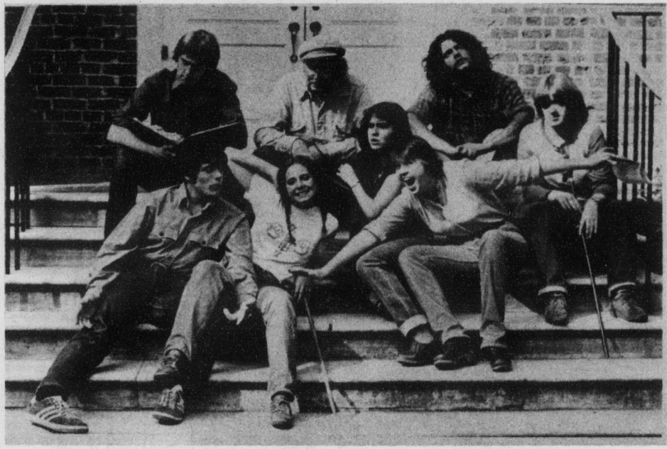
Reveling in the thought of being ernest these cast members take a break from rehearsing for their fall production.