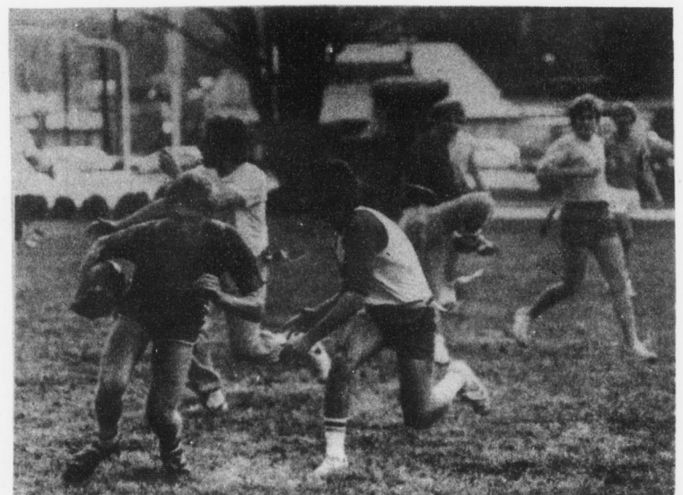
The Nads of Milner third South whooped the Wahoos November 5, ending the Intramural flag football season.