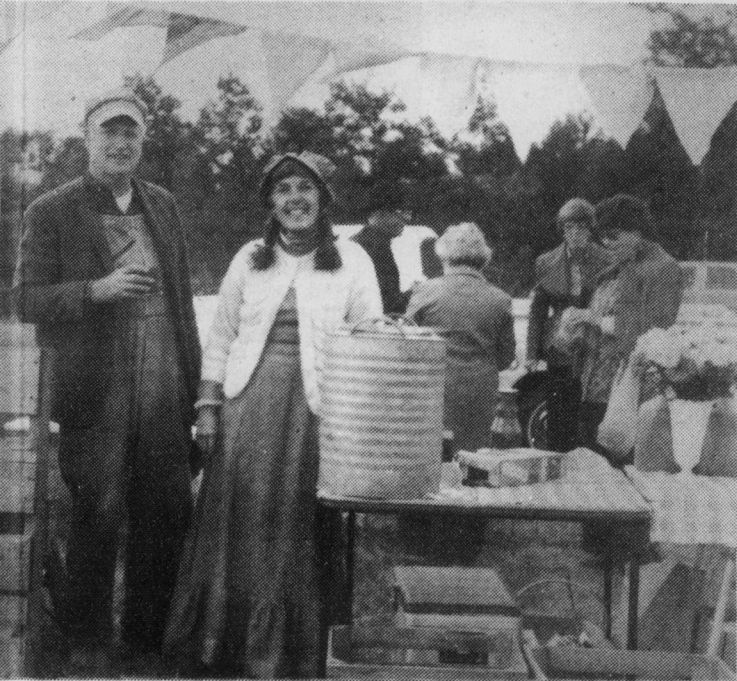
Go for it! At the Brushy Mountain Apple Festival on Oct. 1.

Do you want the night sky to contain more than just a bunch of stars? Every Friday evening at 7:00 p.m., the Morehead Planetarium in Chapel Hill presents a "sky rambles" program featuring currently visible planets and constellations. Also at the planetarium will be "Einstein's Universe," from Sept. 6 through Nov. 14.