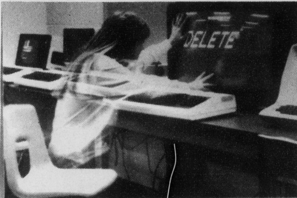
An unknown student was witnessed accidentally striking the 'Delete' mode...