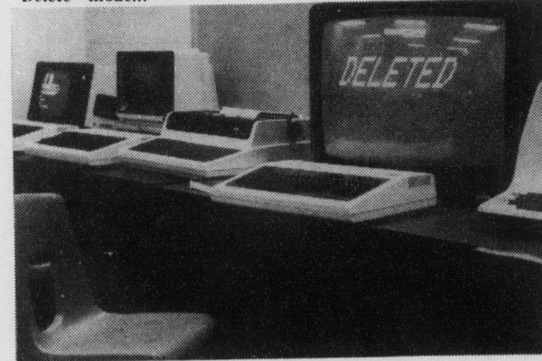
She was consequently... Deleted!