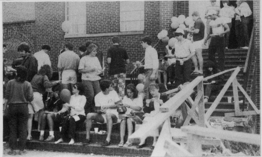
Students gather to share serendipitous victuals.