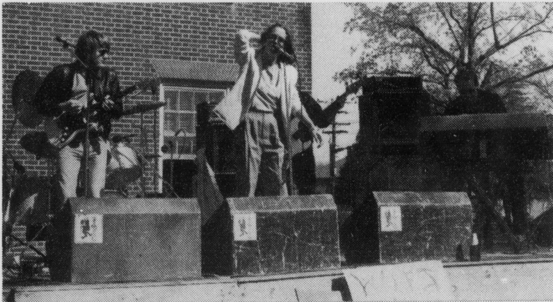
Tornado wipped up a storm Saturday afternoon.