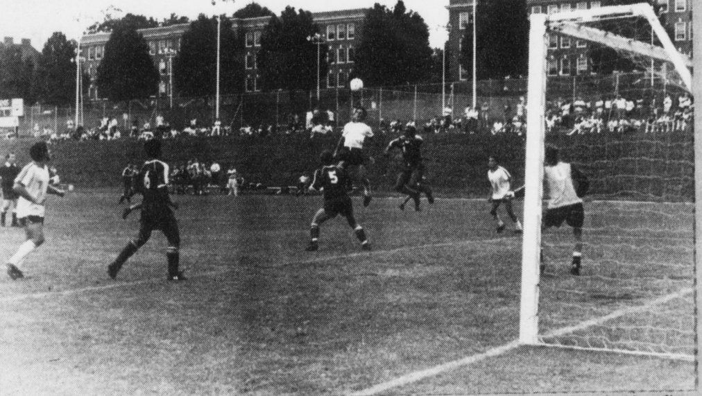
UNCG was just ahead above Guilford in season opener.