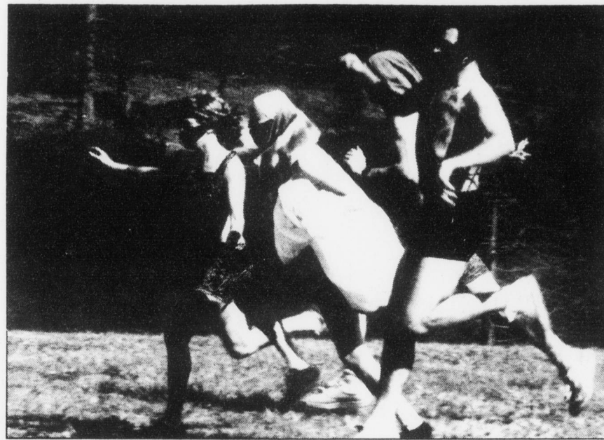
The Guilford Modern Biathlon squad practices its five-mile barefoot frolic. The team has shaved 1:03 off its average pace in the event since its first practice in December

The sport of Modern Biathlon is played on nearly every college campus in the United States, and is sanctioned by NOW and Greenpeace along with the NCAA. The Quakers will also be eligible for championship consideration by standards set forth by the Old Dominion Athletic Conference, in which 11-member institutions currently are fielding teams. Hampden-Sydney does not have a team due to its