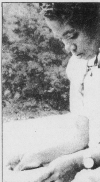
Another beautiful day at Guilford.