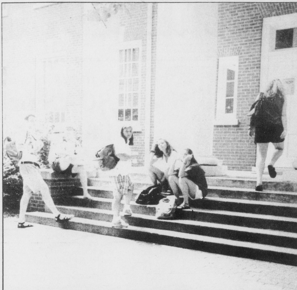
Students take a well-deserved break between classes in Front of King