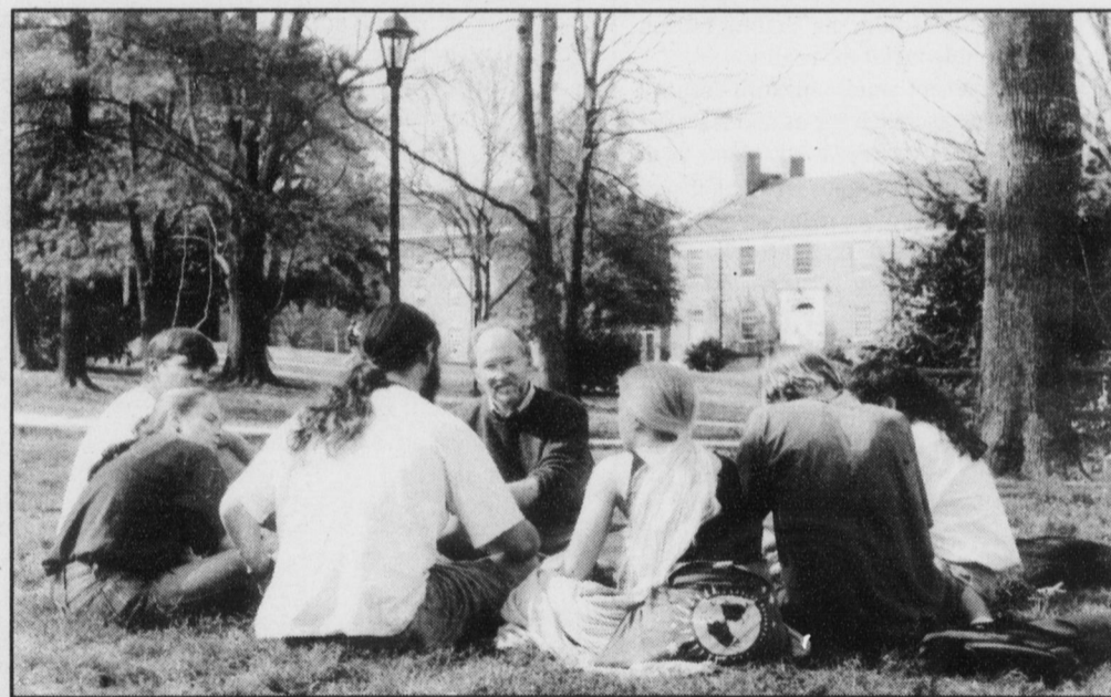
Guilford students meet with David Molpus, Southeastern correspondent for NPR