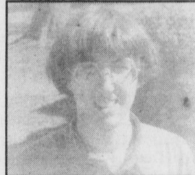
"Neither am I."

The Guilfordian Guilford College P.O. Box 17717 5800 W. Friendly Ave. Greensboro, NC 27410