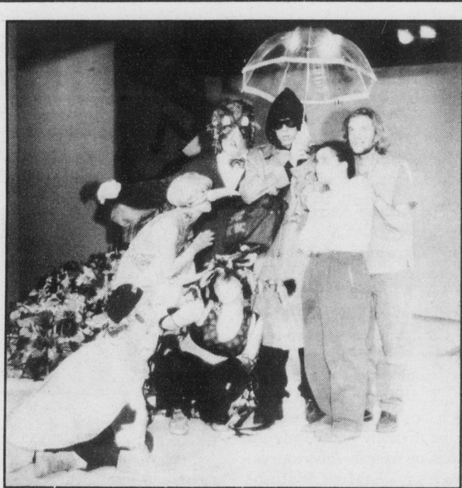
Two youths, disillusioned with urban life and civilization, leave the metropolis in search of utopia in the Guilford College Theatre Studies Department fall production of Aristophanes' The Birds . The show will be staged on November 8-9 and 14-16 at 8 p.m. in Sternberger Auditorium.

Senate would like to remind residents of Guilford College to act responsibly and remember those who must clean up after you. The messes do not magically disappear; there is someone on this campus who has to pick up what you leave behind. Be mindful of these people and help them by keeping Guilford clean.