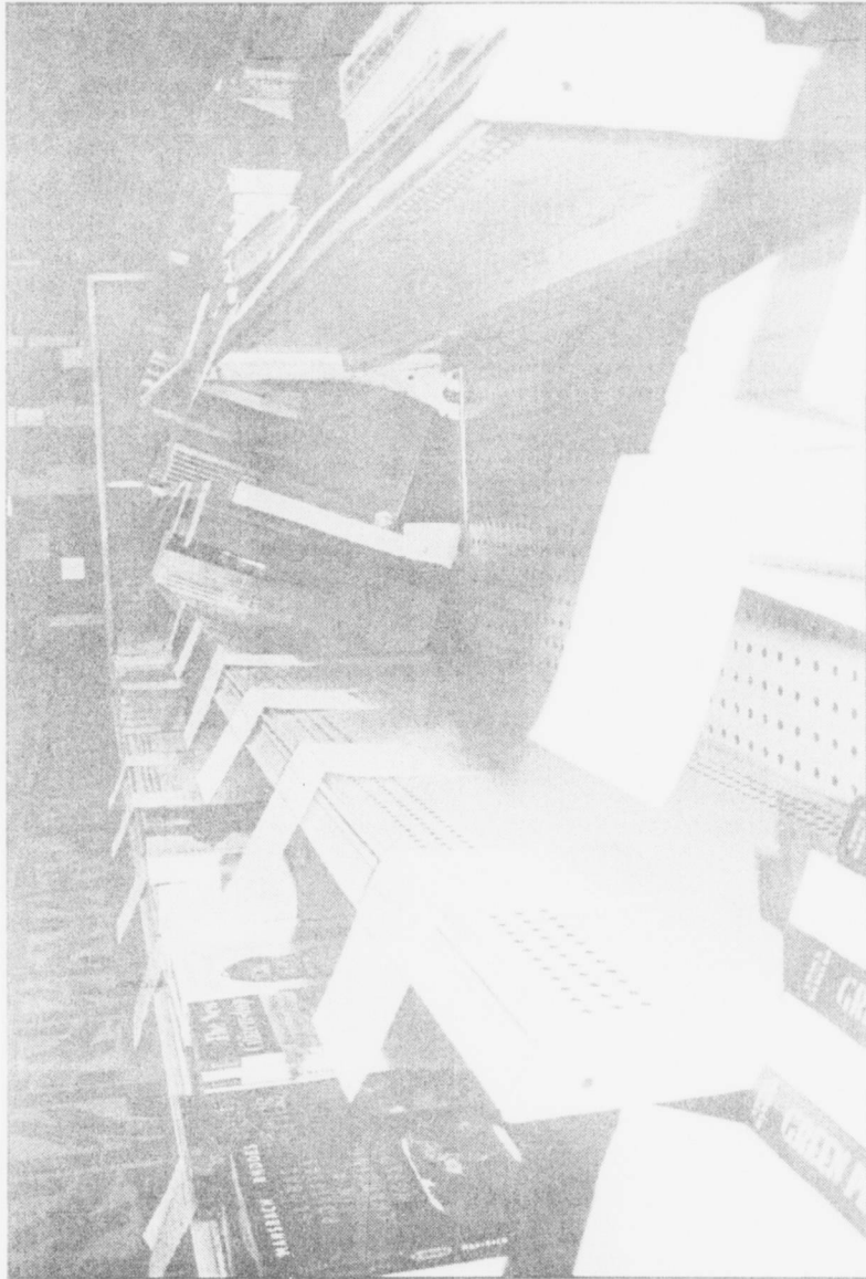
Because of its hurried takeover of the Guilford College bookstore, Follett has had some trouble meeting student demand. Empty bookshelves are just one of the problems.