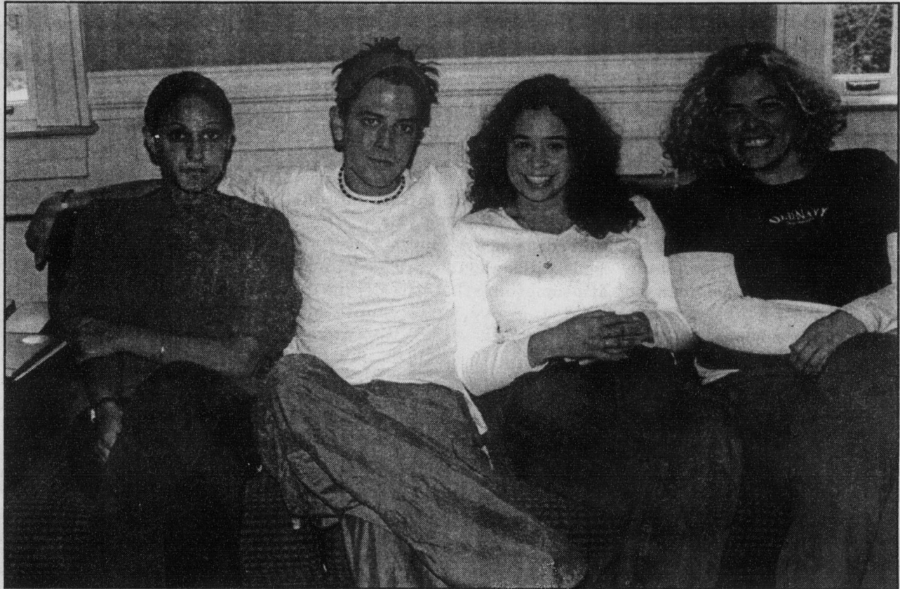
The Page ticket relaxes making plans for next year.

Babcock: We're also looking at finding a time when more students will be able to come to Senate. We're not sure if we will be able to change the meeting time yet,