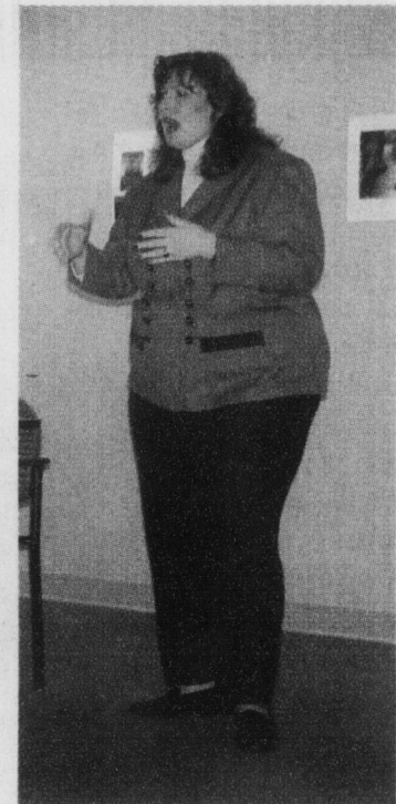
Hansen talks about the facts and myths of sexual assault.

Once you are at the hospital a rape crisis advocate will be called immediately to provide you with emotional support, and an FNE will be called in to perform an evidentiary exam and administer emergency prophylactics. You will then be given resources for follow-up care and counseling.