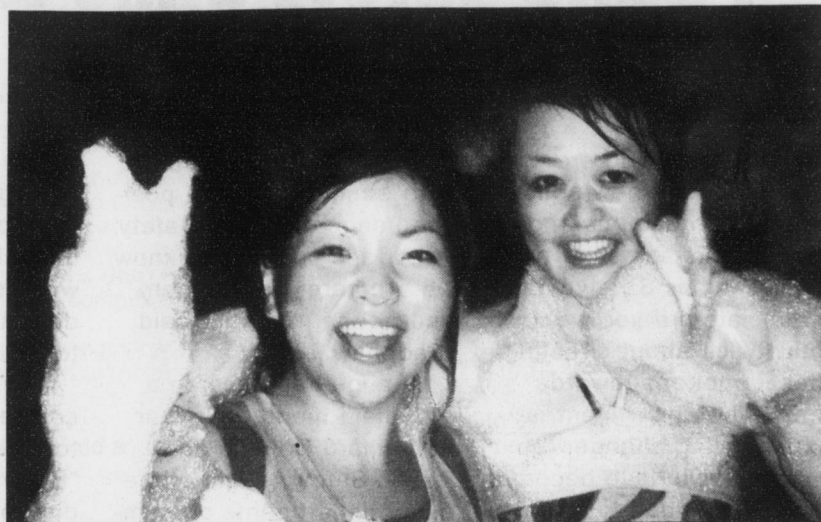
Students enjoying themselves at the foam party Sept. 18 in the Bryan Quad

Because of new social gathering rules prohibiting any student-hosted partying on campus, keeping campus life exciting is a big responsibility. So far this year, Student Union has shown the movie Wet, Hot American Summer , sponsored a tournament for the video game