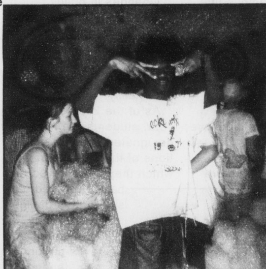
A Guilford student poses amidst the foam

Madden football , and bused students into downtown Greensboro.