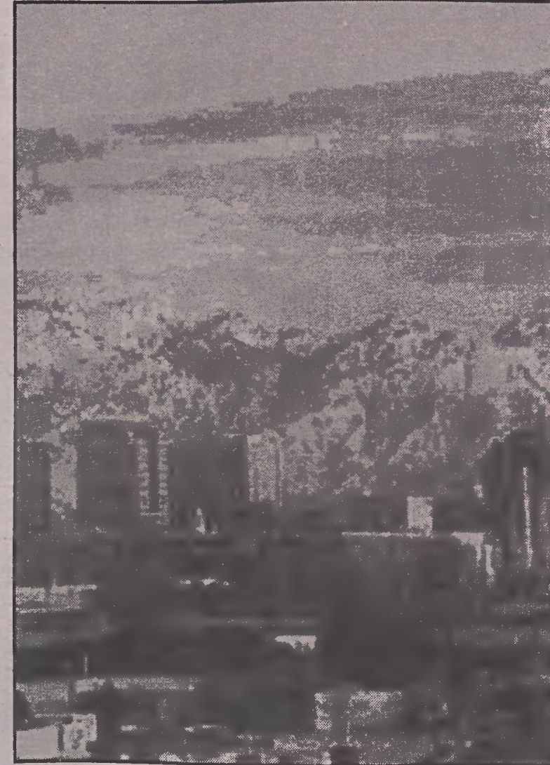
Salt Lake City

This mountain range had nice, smooth and well-groomed trails. It was for skiers only - no snowboarders allowed! The only problem here was the wind chill. On the day we visited the resort, it was really cold on the chair lifts with temperatures reaching 10-15F.