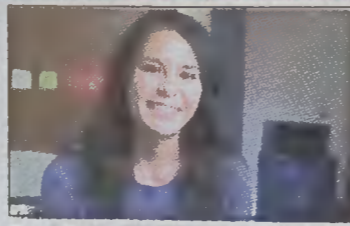
Fall Break by Ashley Lynch