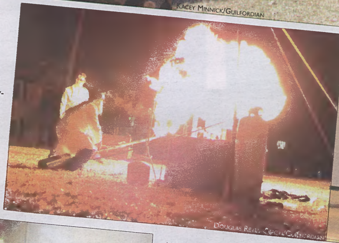
(Immediate right) Feb. 5 saw the Flaming Faeries put on a mesmerizing fire show outside Dana Auditorium. (Far right) At the Geek Auction held later that evening, guests were encouraged to bid on "delightful young geeks" to dance with at the formal following the event. Proceeds from the auction were donated to Child's Play, a charity that raises money to purchase toys, games, books, and financial support for kids in hospitals across North America and the world.