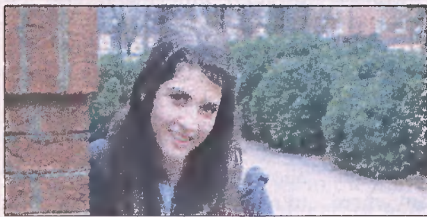
Laura Devinsky STAFF WRITER

Have you ever seen a 400-foot-tall tree? Because I know I haven't. If you were going through forests in Northern California, redwoods — monstrous trees that stand at 400 feet, or the equivalent of a 40-story building — wouldn't be uncommon.