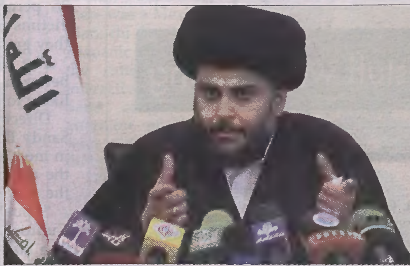
OLU, TEHRAN TIMES.COM

"Out of my desire to complete Iraq's independence and to finish the withdrawal of the occupation forces from our holy lands, I am obliged to halt military operations of the honest Iraqi resistance until the withdrawal