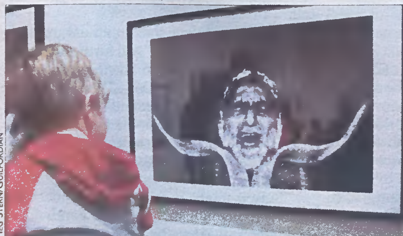
People of all ages came to see the opening of the self-portraits of Bahraini and American Muslims exhibit in King Hall.