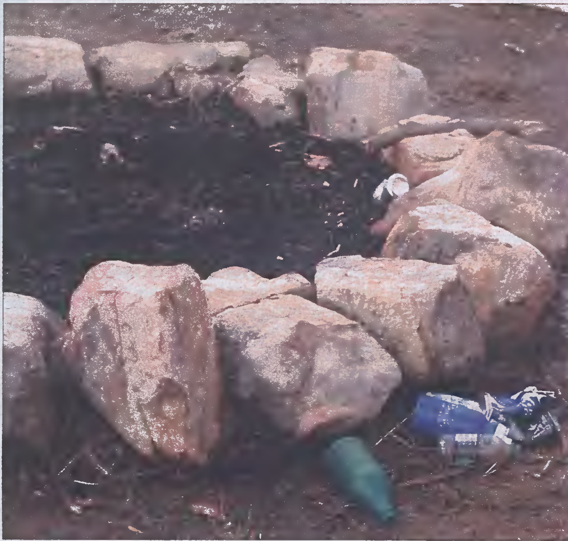
The tradition of holding bonfires in the woods is being put out by administration. There is one official bonfire pit by the lake, which can be used by students upon request.