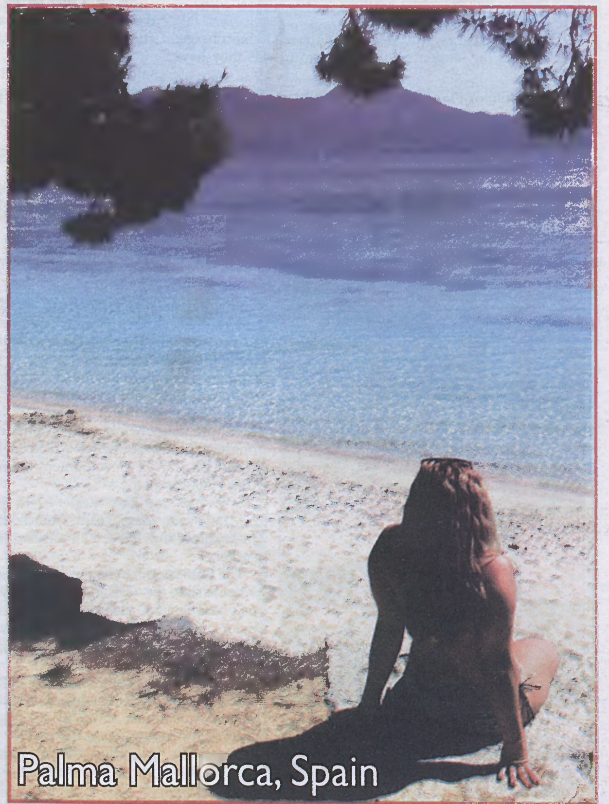
Palma Mallorca, Spain