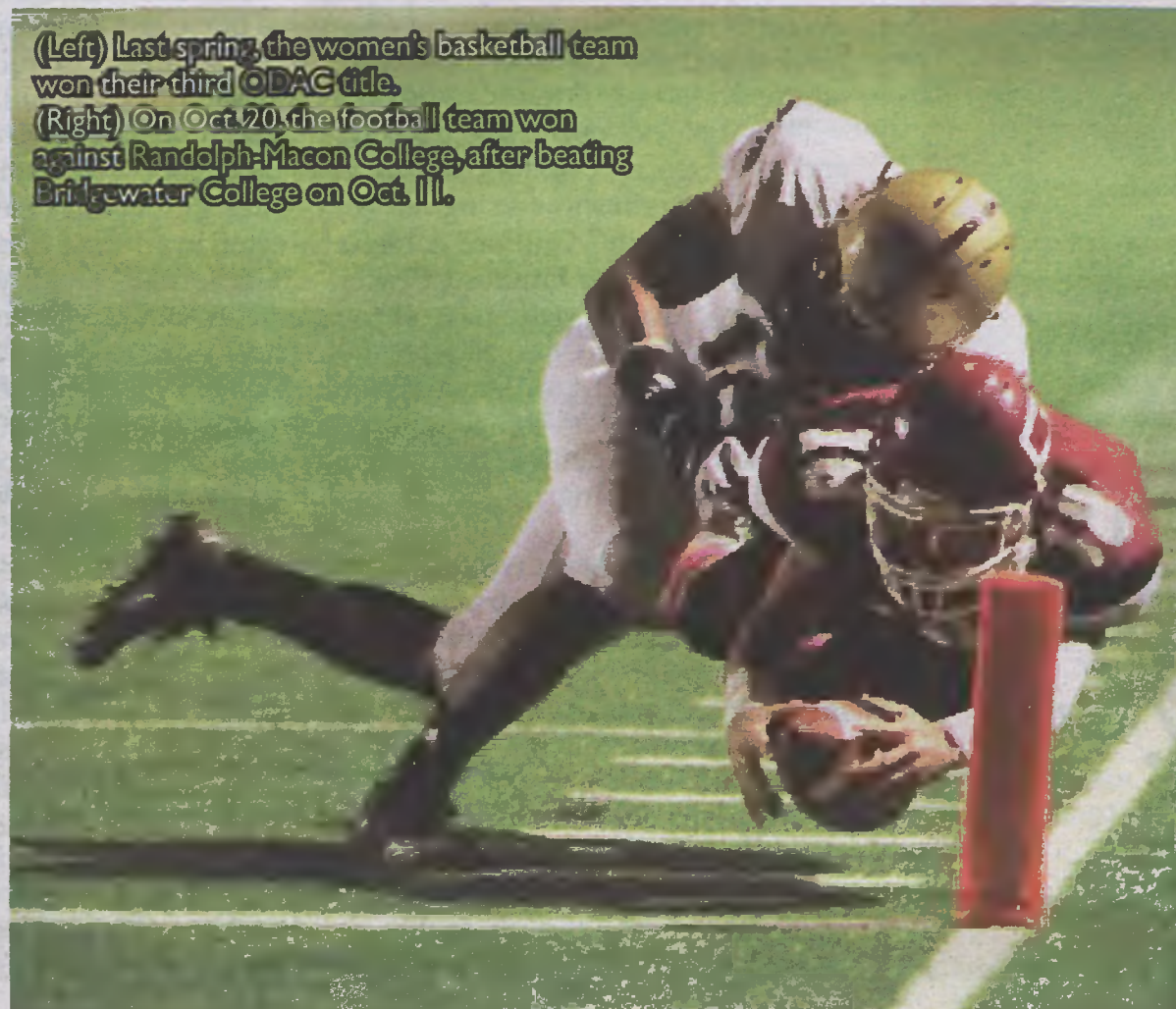
(Left) Last spring, the women's basketball team won their third ODAC title. (Right) On Oct. 20, the football team won against Randolph-Macon College, after beating Bridgewater College on Oct. 11.