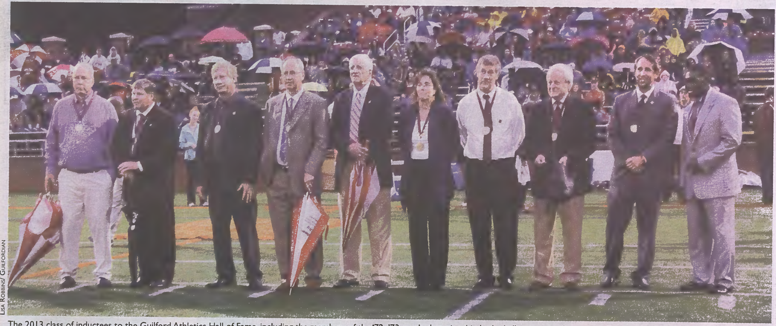
The 2013 class of inductees to the Guilford Athletics Hall of Fame, including the members of the '72-'73 men's championship basketball team, were honored before the football game during Homecoming.