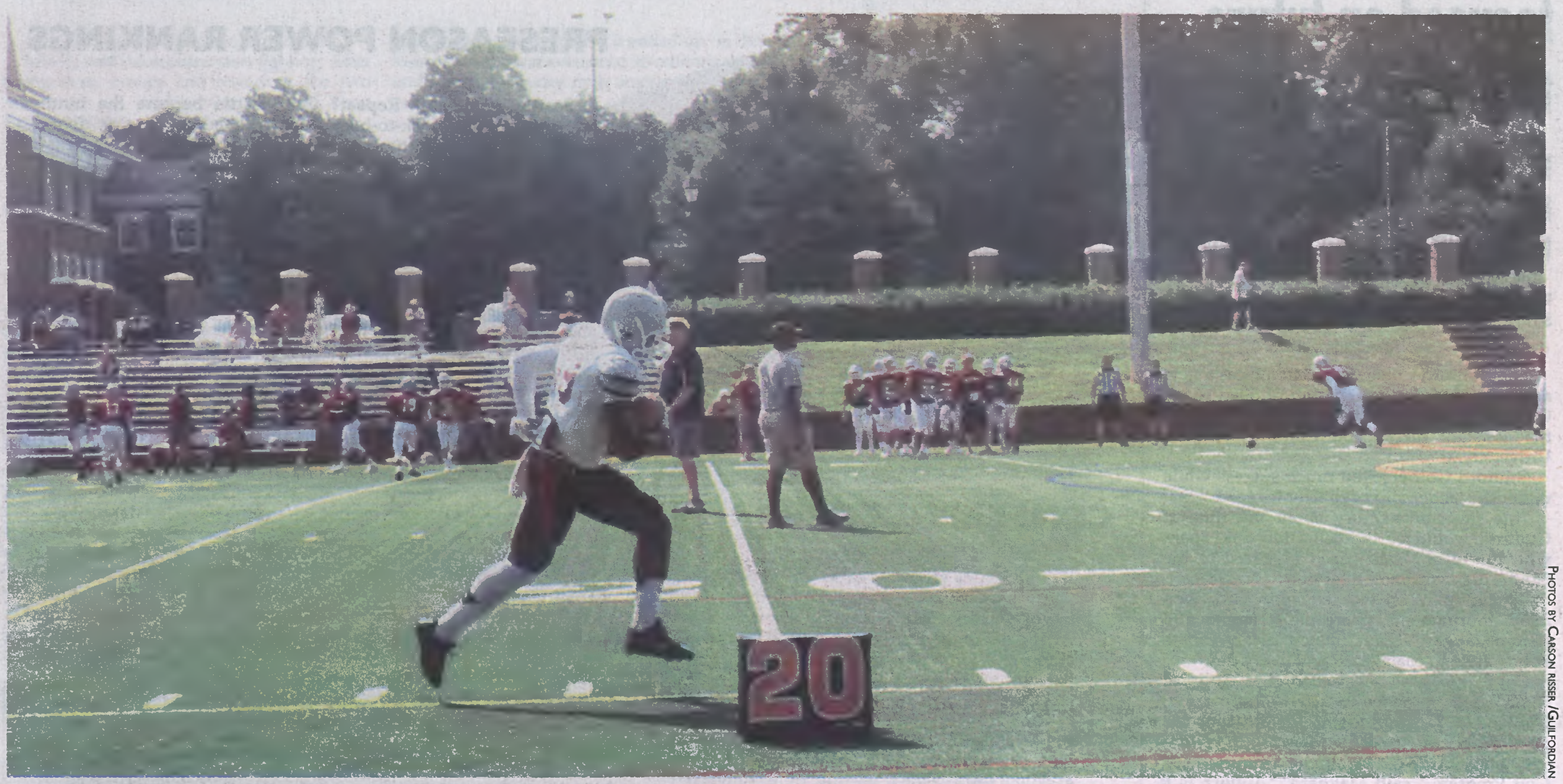
The Guilford College football team practices on the Armfield Atheltic Center in preparation for their first game on Saturday, Sept. 6, against Greensboro College for the 19th annual Soup Bowl.