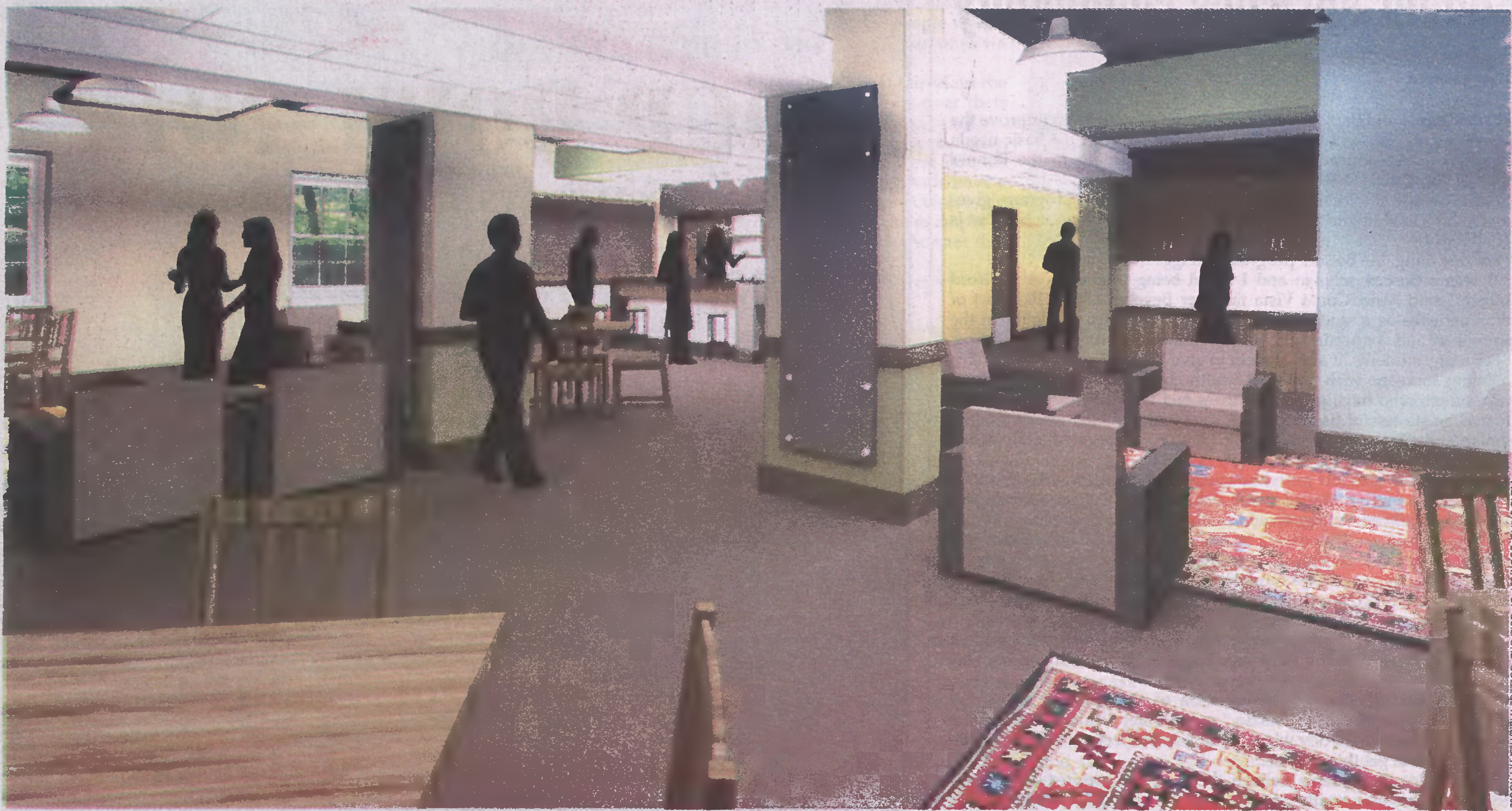
RENOVATION COURTESY OF GUILFORD COLLEGE FACILITIES/THI HOUSE