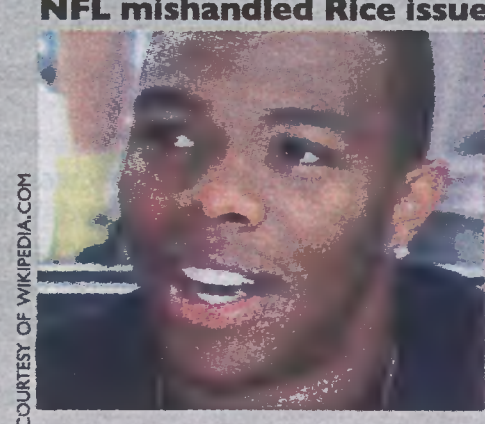
BY LANDON FRIED STAFF WRITER